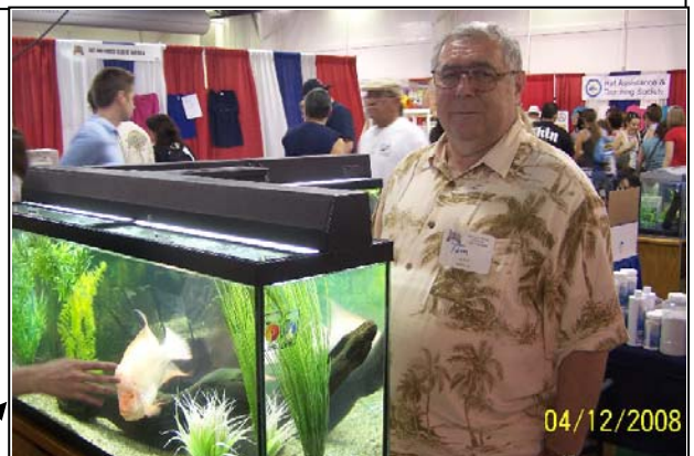
The beginning symptom of fish-itis: a hand reaching out to pet a big fish!